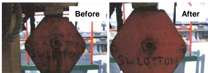
The lifting block was covered with oil. Grease stains were seen dripping off from the wire rope lubricant which was applied onto the crane wire.