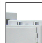
Solid Chromed boltwork