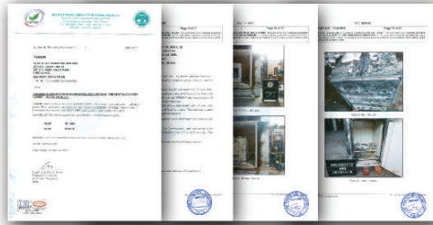
Tested & Certified to JIS S 1037 : 1989 FIRE RESISTIVE CONTAINERS