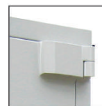
Heavy Duty Chassis