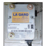
Glass Relocker (Optional)