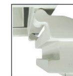
Vertical Interlocking Rebate System