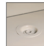
Mounting Hole (Optional)