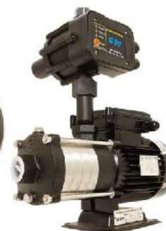
CHLF(T) - PC