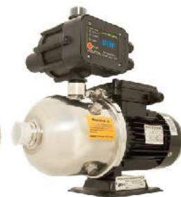
CHL - PC