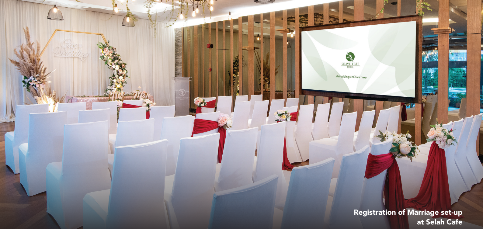
Registration of Marriage set-up at Selah Cafe