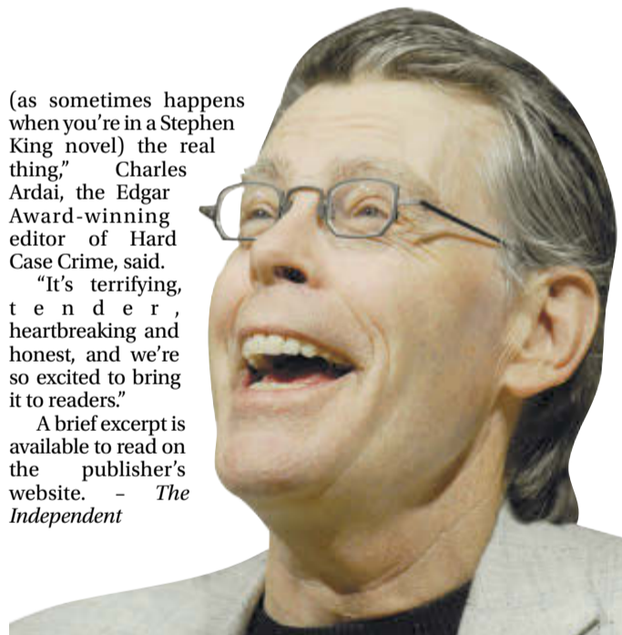
King's new novel involves a boy with an unnatural ability to see what no one else can see and learn what no one else can learn.