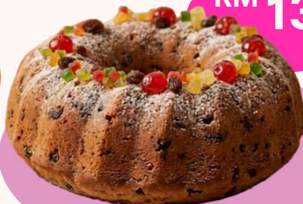
CLASSIC FRUIT CAKE