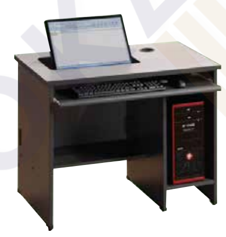
Computer Workstation (Displayed with 19" monitor) 894W \times 600D \times 750H