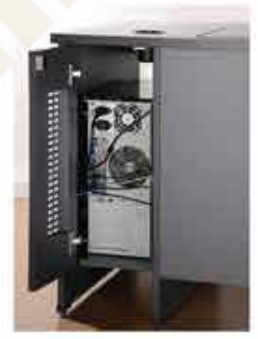
Hidden cable wire manager channel through the base lets you organize wires and cords