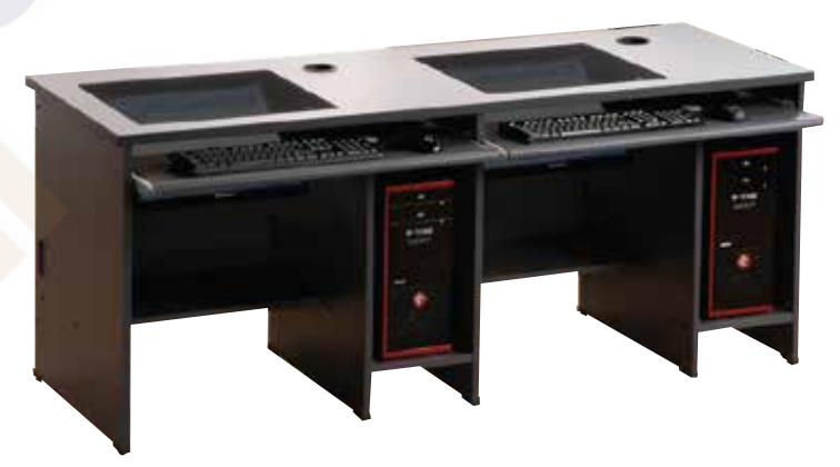
Computer Workstation (Displayed with 19" monitor) 894W \times 600D \times 750H