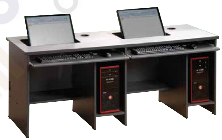
Computer Workstation (Displayed with 19" monitor) 1732W x 600D x 750H