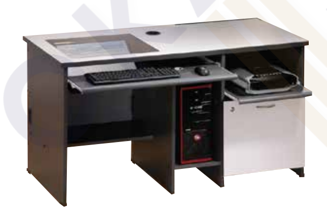
Computer Workstation (Displayed with 19" monitor) 1732W x 600D x 750H