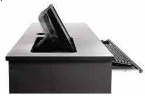
Exclusively Designed Workstation for LCD flat screen monitor ensures an easier viewing. Perfect for the library or computer lab, these workstations function flawlessly in virtually any setting. Their ergonomically designed, semi-recessed monitor tubs not only provide a more comfortable 30 degree viewing angle for the user, but also allow for better visual contact between teachers and students. These tables are professional, commercial quality and built to last.