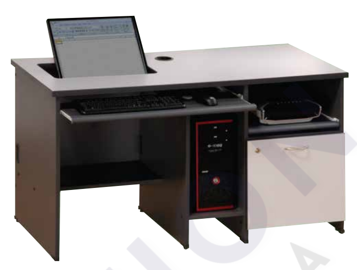
Computer Workstation (Displayed with 19" monitor) 1348W x 600D x 750H